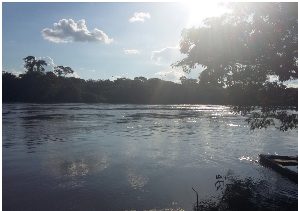
Arinos River, Juruena River sub-basin, Mato Grosso, Brazil.

The proposed Castanheira Dam is prioritized in the latest version of Brazil's Ten-Year National Energy Expansion Plan. Planned to be built on the Arinos River in Mato Grosso State, the proposed dam is considered strategic for the energy sector by Brazil's federal government. Among more than 100 projects proposed for the Juruena sub-basin, the Castanheira Dam stands out as one of the few that, according to official project documents, would not flood areas designated for indigenous peoples or conservation areas. However, despite careful planning with regards to flooding, the benefits associated with the project might not be large enough to justify the costs.